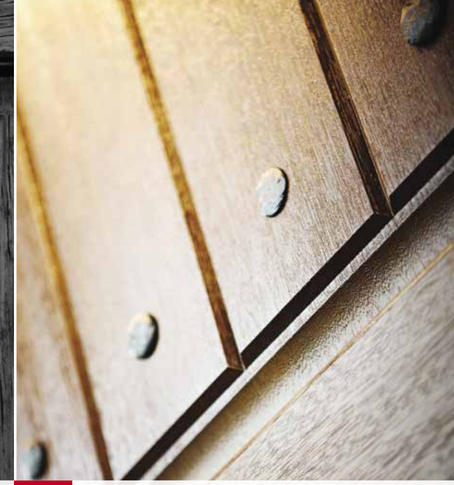
THINK YOU WANT A WOOD DOOR?