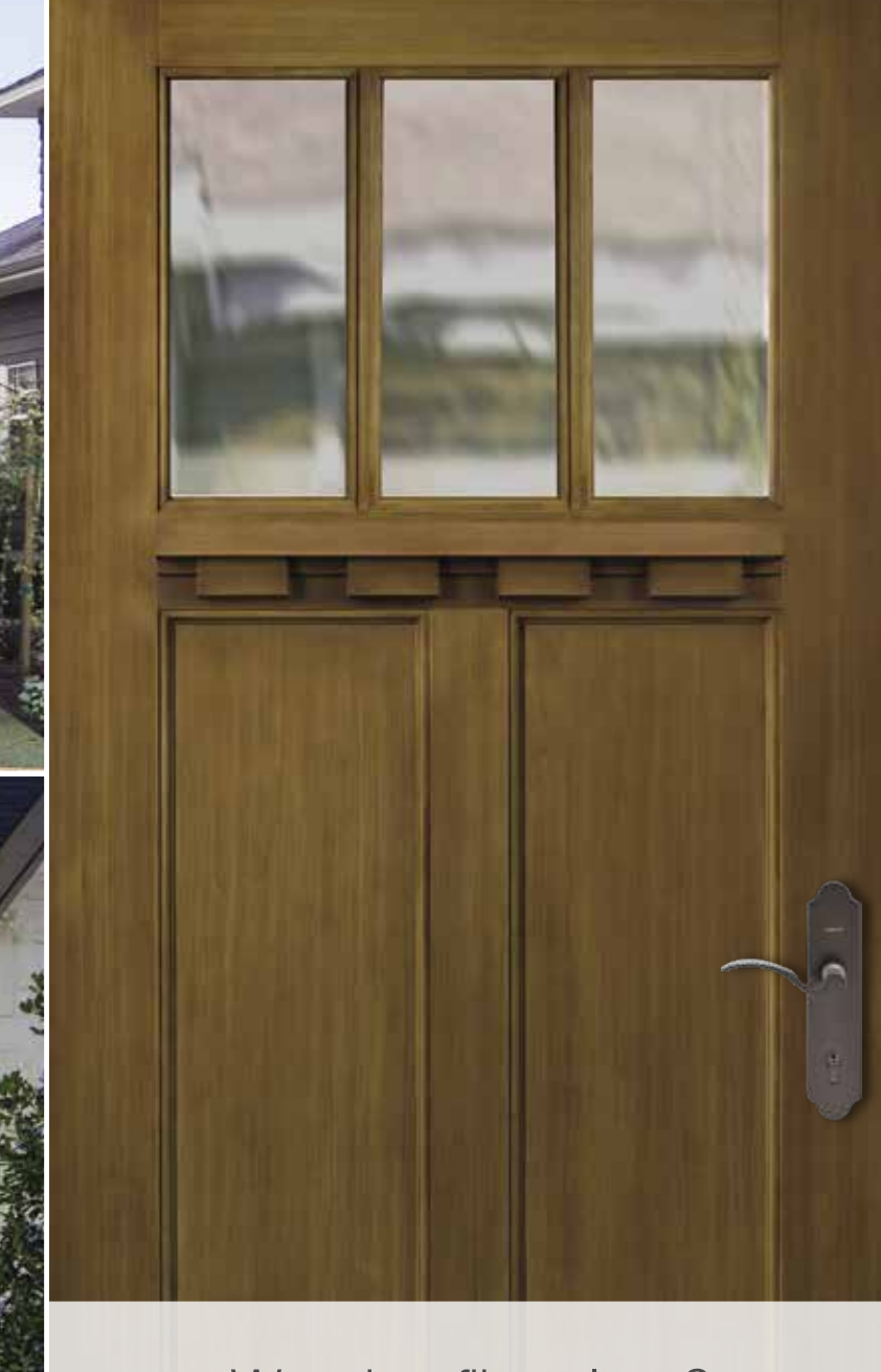
Wood or fiberglass?