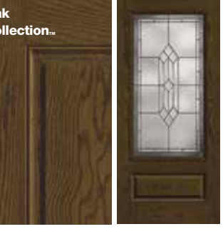
Note: Finish colors may vary from an actual application due to fluctuations in finishing or printing. See your Therma-Tru seller or visit www.thermatru.com for details on limited warranties and exclusions